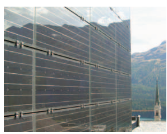
Methodology of solar strategies

This project investigates the potential of active and passive solar strategies for renovation of residential estates and new build replacements in urban areas based on two case studies. Through organisational, structural, and formal language, «solar buildings» are the flagship of an energy concept. This consistent climate rhetoric leads to new typologies of ecologically sound buildings and necessitates new integrative and holistic design strategies. The earlier solar strategies are integrated into the design, the higher the potential, and the cheaper their realisation.