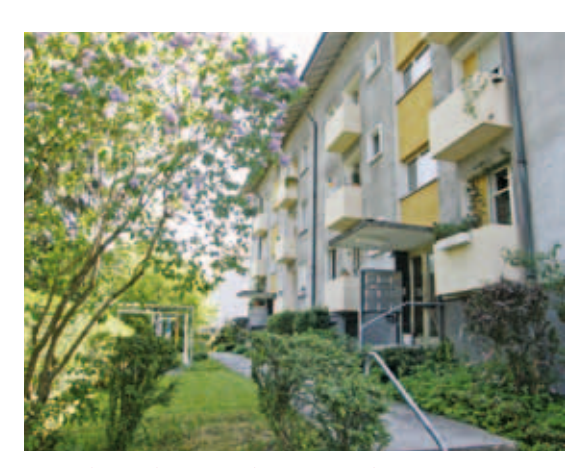
IEA Task 41 Solar-Energy

The objective of this Annex is to develop and demonstrate an innovative, holistic building renovation concept for typical apartment buildings. The concept is based on standardised façade and roof systems that are suitable for prefabrication. The highly insulated building envelope includes the integration of a ventilation system. The concept focuses on typical apartment buildings representing approximately 40 % of the existing dwelling stock.